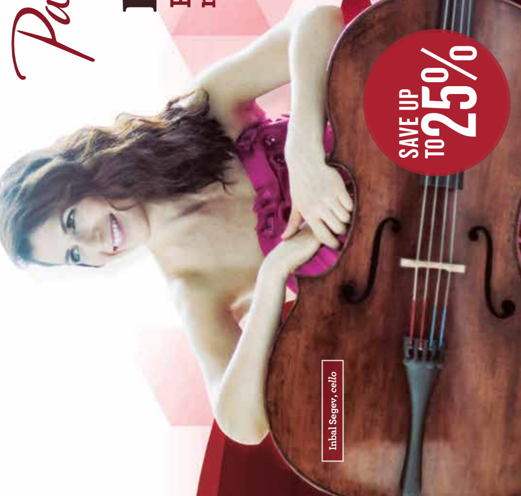
Inbal Segev, cello

SUBSCRIBE THE WAY YOU WANT AND SAVE UP TO 25%